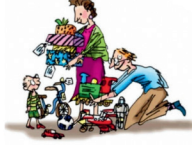
spoil the boy