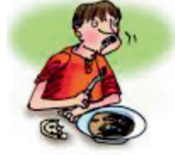
chew the stew

2. new , knew , flew , blew , few , crew , newt , screw , drew , grew , stew