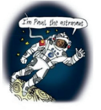
Paul the astronaut

2. Paul , astronaut , August , author , dinosaur , pause