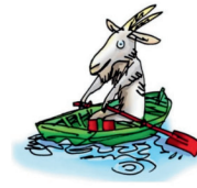
goat in a boat

2. toad , oak , road , cloak , throat , roast , toast , loaf , coat , coal , coach