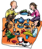
care and share

2. care , share , dare , bare , spare , scare , flare , square , Clare , software