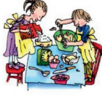
make a cake

2. make , shake , cake , name , same , game , save , brave , late , date