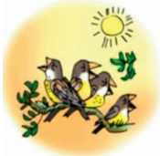
gown at dawn

2. saw , raw , law , straw , dawn , paw , crawl , jaw , claw , yawn